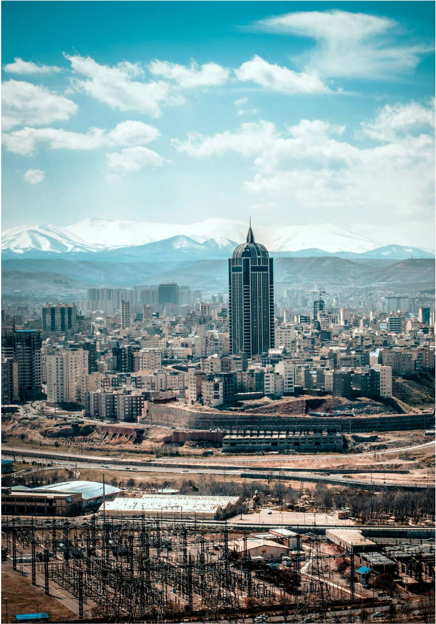
View of Tabriz, Iran.