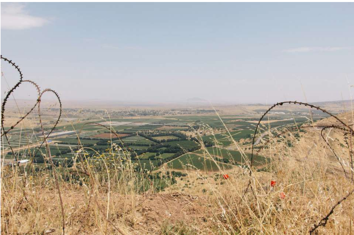
Western Golan Heights.