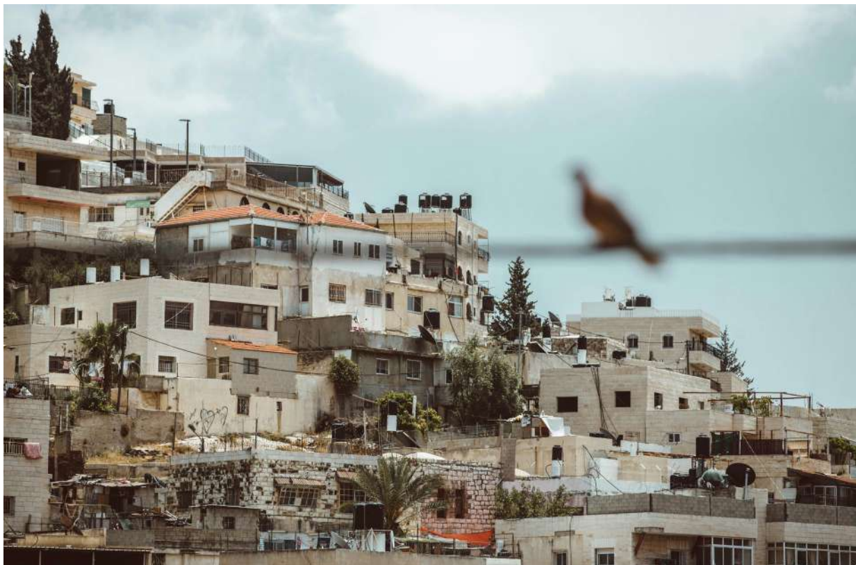
Jerusalem.