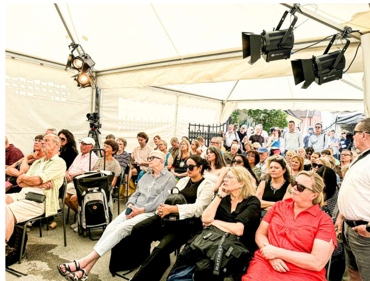
CMES Panel Discussions at Almedalen in June 2024.