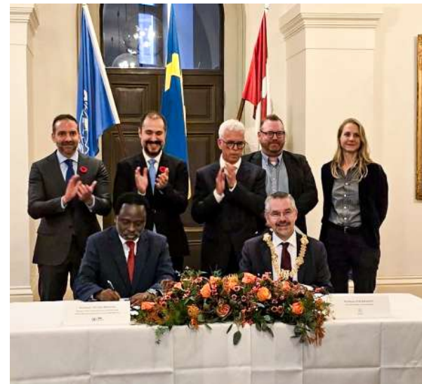
Right: Inauguration of the United Nations University Hub "Water in a Changing Environment (WICE)" at Lund University in November 2024.

CMES is one of three units at Lund University constituting the core team of this strategic partnership.