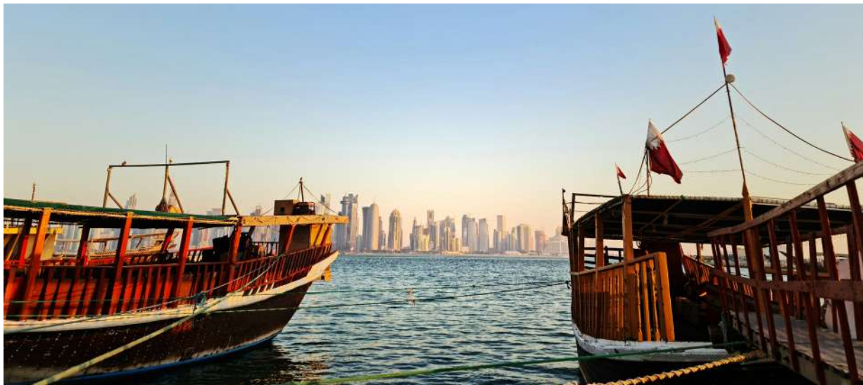
Doha Corniche, Qatar.