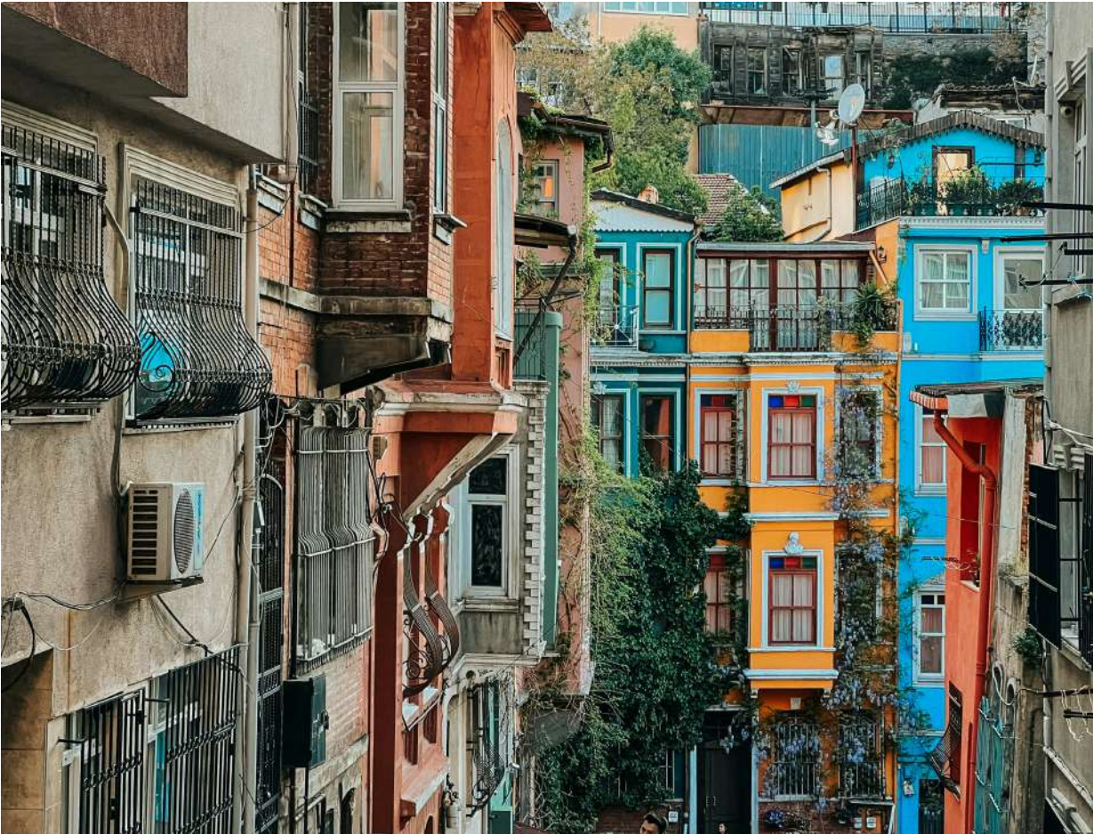
Top: Refugee camp in Syria. Bottom: Istanbul, Turkey.